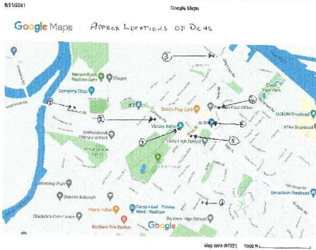
Map showing locations of Dens