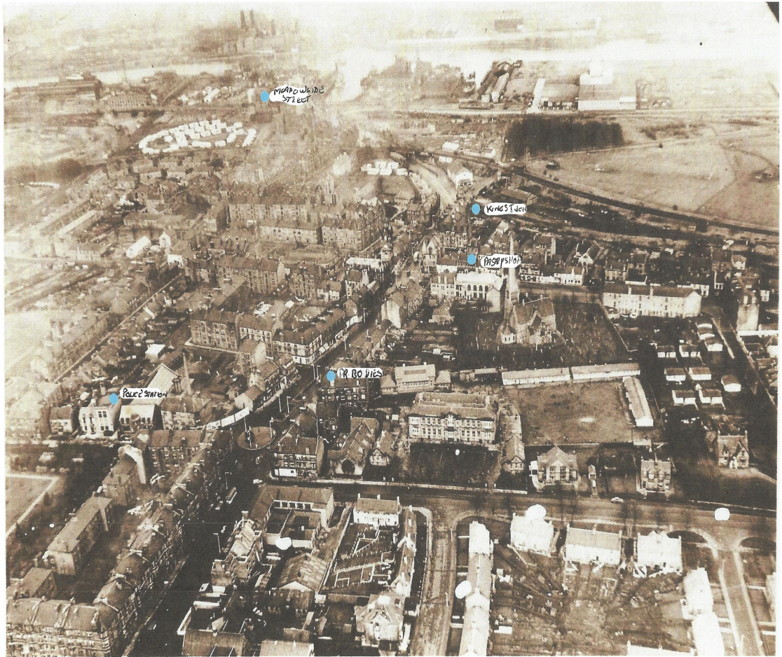
Photo of old Renfrew showing some Den locations

I thoroughly enjoyed the research and reminiscences in connection with writing this booklet and I hope that if you're reading it as an ex-Trinity Scout who enjoyed using the dens, you have been able to relive your experiences; if you're reading it having not been in our ranks, I hope you realised what a great time we had, how much we learned and the great camaraderie which existed.